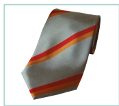
OE Field Game Society Tie Silk