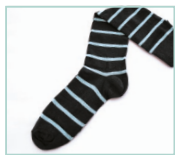
OE Socks Cotton/Lycra, one size