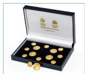
OE A Buttons Set of 12 or 14.