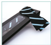
OE Bow Tie Silk, self tie