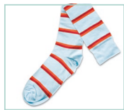
OE Field Game Socks