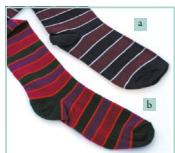
a. Viking Socks b. Rambler Socks