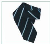
OE Tie Silk, in OE colours.