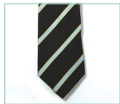
Pop Tie Silk, in Pop colours