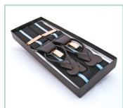
OE Braces Real leather brace ends, gilt steel fittings, multi fit